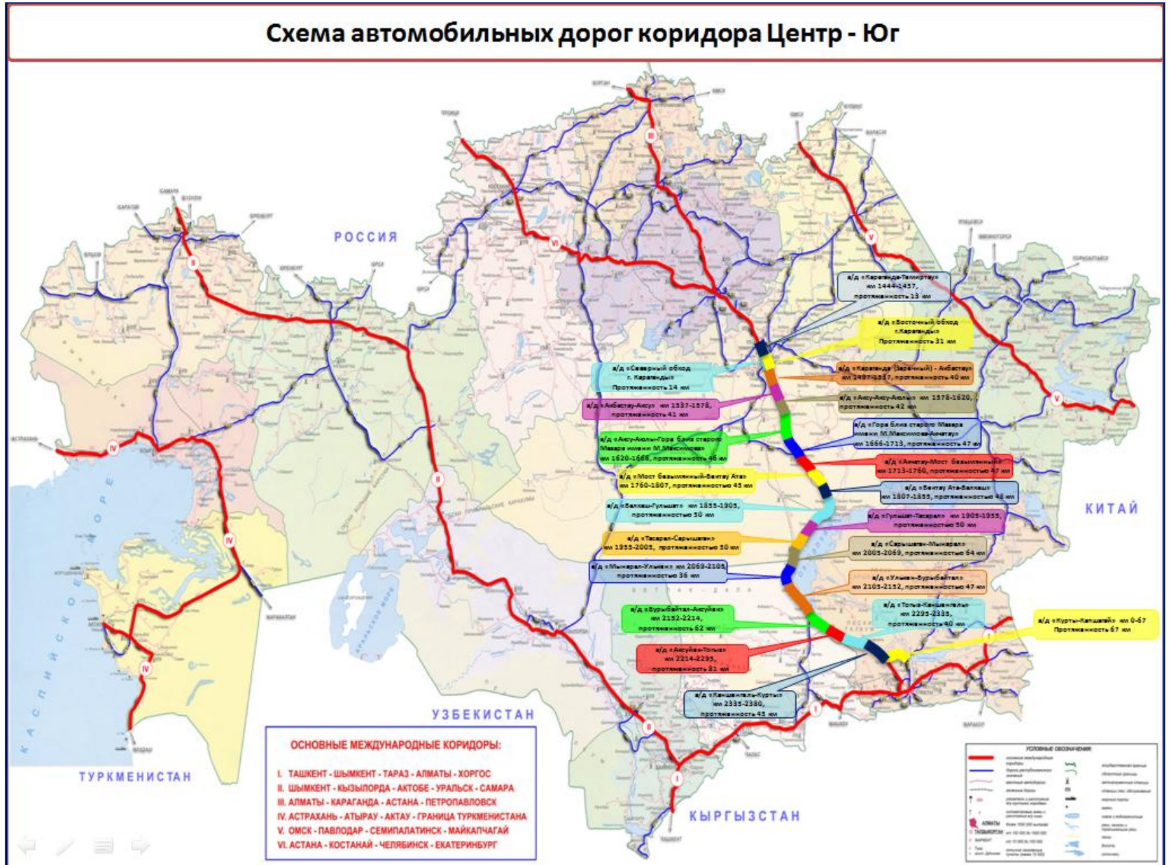
Figure 1 Karaganda-Balkhash-Burylbaital-Kurty-Kapshagai Road Section, Center-South Corridor